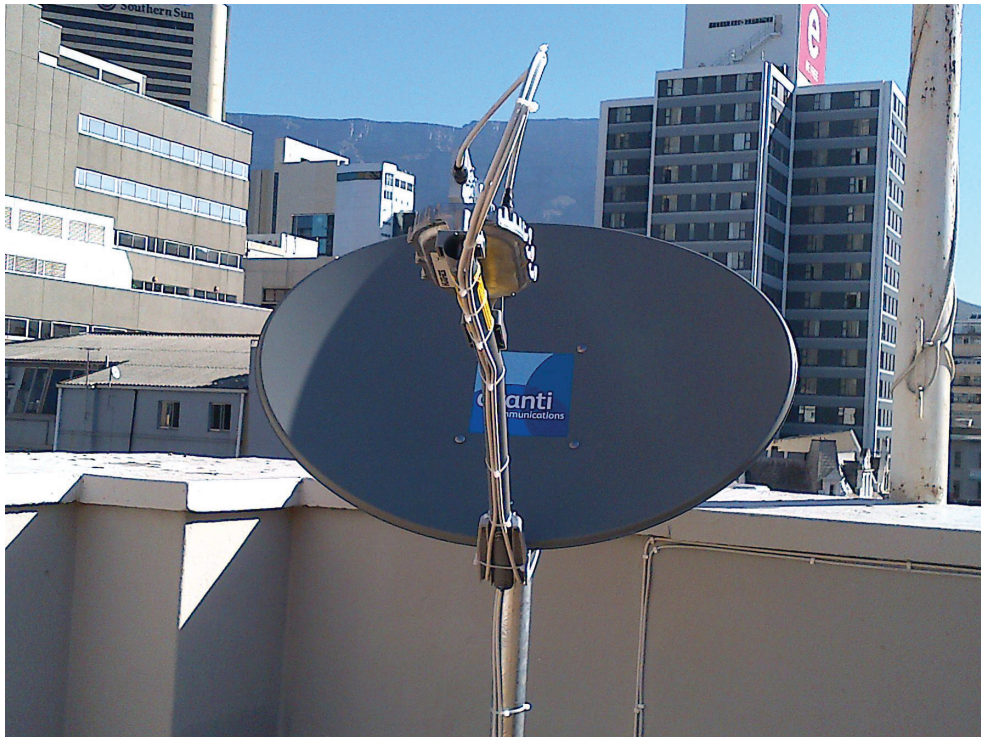
Avanti's high performance satellite terminals are small and easily installed

In contrast, Avanti's user terminals are small and easy to install – we think it's just common sense to minimise the costs of user terminals and their installation, while maximising reliability.