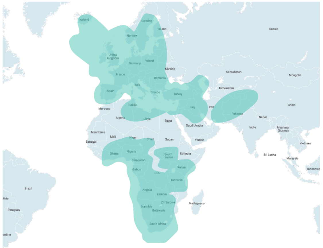
The HYLAS fleet provides full national coverage of all key countries in EMEA

When designing a coverage pattern, it is mathematically possible to place spot beams to cover any region using these four combinations, or "colours", without any spot beam having the same "colour" as any of its immediate neighbours. However, depending on spot beam size and location, it is still possible to experience interference from other, nearby spot beams with the same frequency and polarisation combination. To avoid this, the spot beams must be moved apart. However, this can cause "canyons" in coverage between neighbouring spot beams where the rapid roll-off in spot beam performance means that high quality services cannot be achieved. This leads to non-uniform service performance within the coverage area and complicates service provision. Avanti has avoided this problem by performing extremely detailed simulations of spot beam performance and optimising the geographic locations of its beams. Avanti's customers require high quality, uniform services driving the optimisation process.