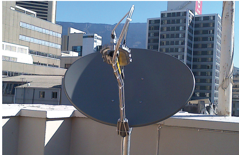
Avanti's high performance satellite terminals are small and easily installed

In contrast, Avanti's user terminals are small and easy to install – we think it's just common sense to minimise the costs of user terminals and their installation, while maximising reliability.