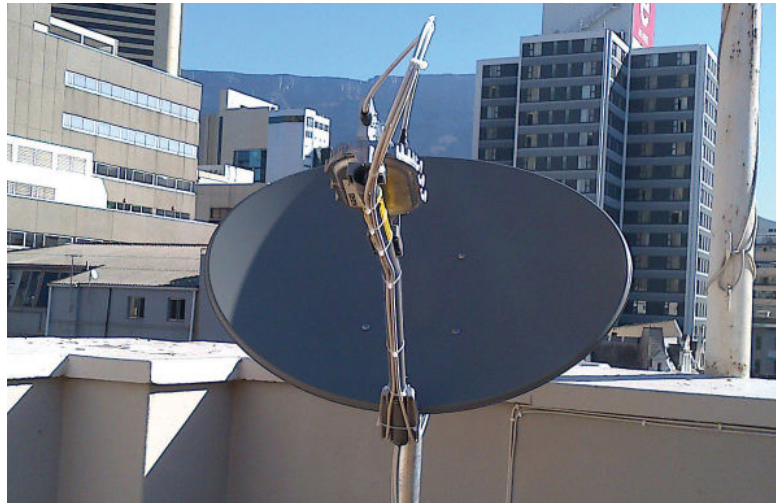
Avanti's high performance satellite terminals are small and easily installed

In contrast, Avanti's user terminals are small and easy to install – we think it's just common sense to minimise the costs of user terminals and their installation, while maximising reliability.