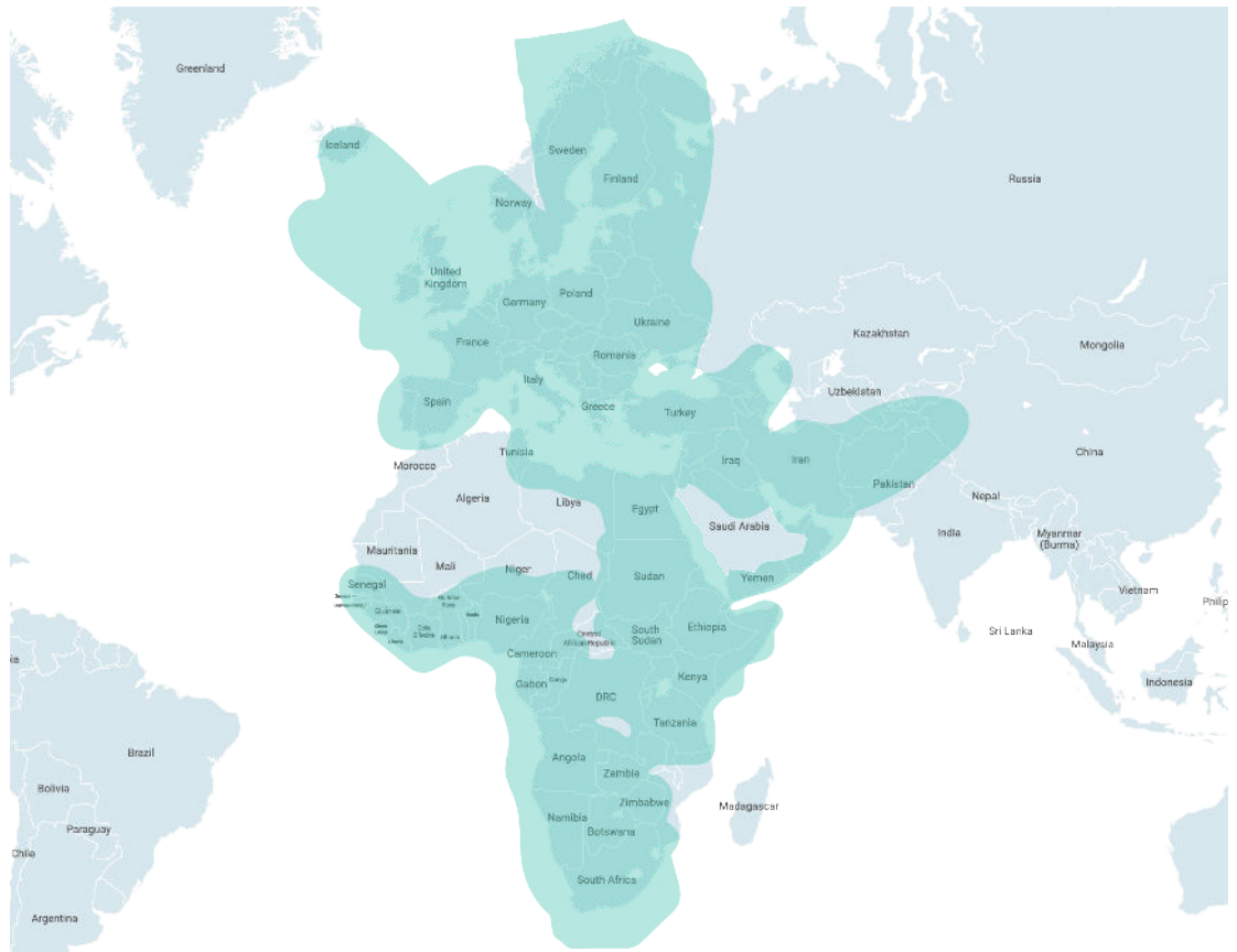
The HYLAS fleet provides full national coverage of all key countries in EMEA

When designing a coverage pattern, it is mathematically possible to place spot beams to cover any region using these four combinations, or "colours", without any spot beam having the same "colour" as any of its immediate neighbours. However, depending on spot beam size and location, it is still possible to experience interference from other, nearby spot beams with the same frequency and polarisation combination. To avoid this, the spot beams must be moved apart. However, this can cause "canyons" in coverage between neighbouring spot beams where the rapid roll-off in spot beam performance means that high quality services cannot be achieved. This leads to non-uniform service performance within the coverage area and complicates service provision. Avanti has avoided this problem by performing extremely detailed simulations of spot beam performance and optimising the geographic locations of its beams. Avanti's customers require high quality, uniform services driving the optimisation process.